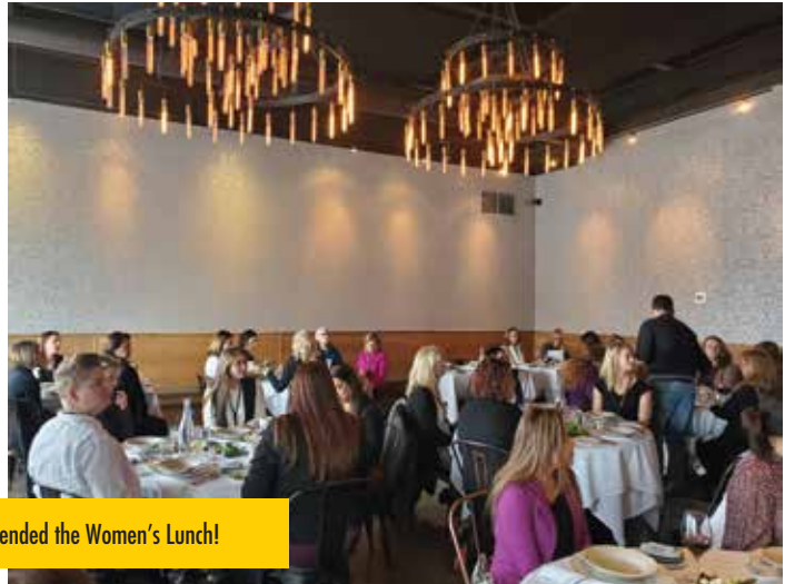
Thanks again to all who attended the Women's Lunch!